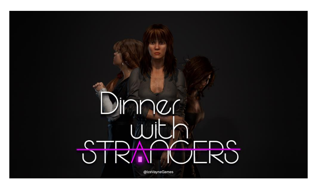
IceVayne Games wins two awards at the NYX Game Awards

Nebraska, October 9, 2022 – Award-winning American Indie Game studio, IceVayne Games , is excited to announce that its newest title Dinner with Strangers has won two awards at the NYX Game Awards. Dinner with Strangers received a Gold Award for PC Game - Horror and a Silver Award for PC Game - Indie.